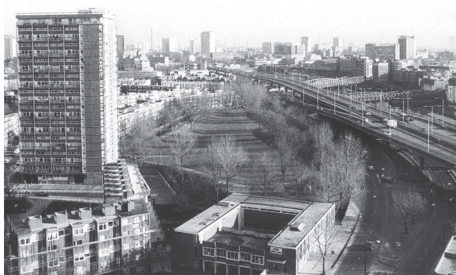
Fig. 3: View of Warwick and Brindley Estate, London. Back cover of Tower Mosaic documentation booklet, 1992

Warwick and Brindley Estate in North Paddington, London, was designed and built by the London County Council (LCC) in the modernist idiom between 1958 and 1962. Sir Hubert Bennett (1909 – 2000) was in charge of the LCC Department of Architecture, having taken over from Lesley Martin in the mid-fifties. The estate includes six 21-story tower blocks, which are clustered in the western half and 23 numbered ranges of low-rise terraces bounded by Paddington train station, the rail lines, and the Grand Union and Regent's Canals (Fig. 3). Under a scheme of 1958 affecting 6,700 residents, the London County Council designated half of the recently-purchased properties in the area to be used for 1,100 dwellings, with a density of about 140 people per acre. The rest of the property was used for shops, garages, schools and other institutions, as well as a canal-side walk and 8.7 acres of badly-needed open space. About a quarter of the extant properties were renovated, while the remainder were war-damaged and required "a full-scale clearance" [Bennett 1960, p. 346]. This area came to be known as the Warwick estate, and soon extended west of Harrow Road over the site of Brindley Street.