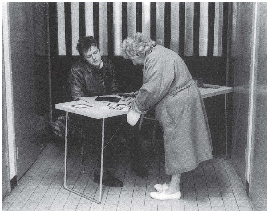
Fig. 5: Volunteers were available in the building foyers to invite participation in Tower Mosaic , Stephen Willats, 1991.

In 1992, Willats wrote in the Tower Mosaic catalog: “... The very fabric of the estate, its physical structure, and the language and experiences of residents was central to the origination of Tower Mosaic (...) Brinklow House and Princethorpe House (...) were considered to be part of the work’ [n. p.]. The black-and-white photographs that Willats used as prompts for